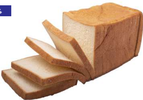
Bread Milk Rich 350 g | AED 7