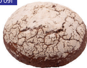
Bread Whole Meal Rye