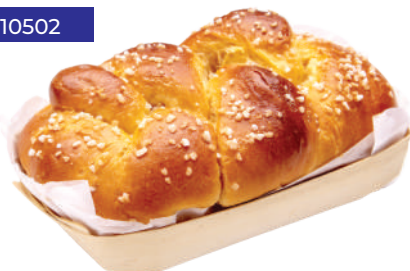
Brioche Traditional 280 g | AED 18