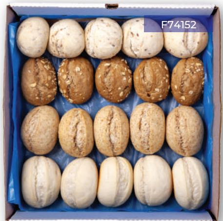
Assorted Bread Rolls (A)

Choice of Ciabatta White, Wholemeal, Sundried