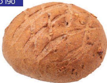
Wholeam Walnut Bread