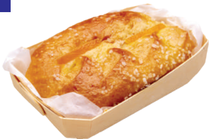
Brioche Orange & Lemon 280 g | AED 19.50