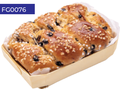
Brioche Choco Chip 280 g | AED 22