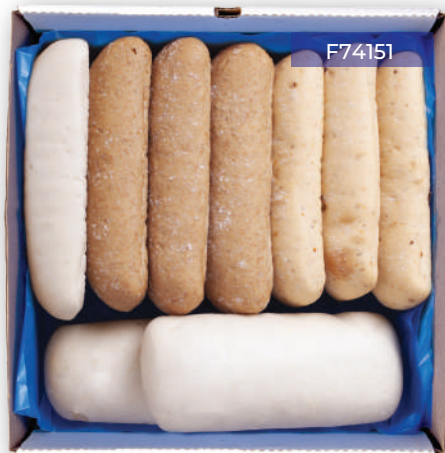
Assorted Ciabatta (A)