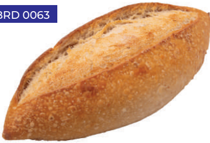
Bread Pain De Campagne