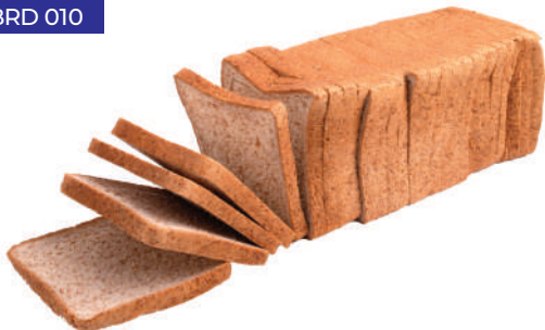
Brown Jumbo Bread Sliced 1200 g | AED 14